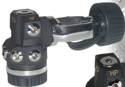
7- First Stage