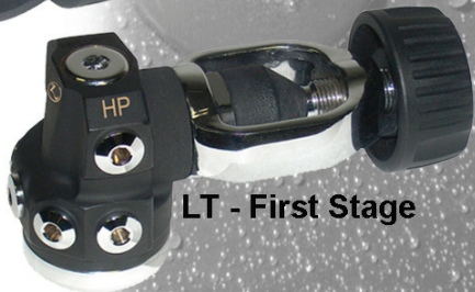
LT - First Stage