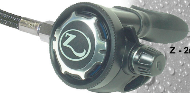
Z - 2nd Stage

Flathead-7 & Flathead-LT, Owner's Manual